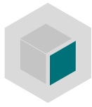
Emerging Markets Case Studies