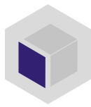
The CASE Journal